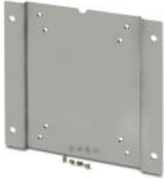
Mounting plate for FL SWITCH 30... and FL SWITCH 40... 16-port switches

Please be informed that the data shown in this PDF Document is generated from our Online Catalog. Please find the complete data in the user's documentation. Our General Terms of Use for Downloads are valid ( http://phoenixcontact.com/download )