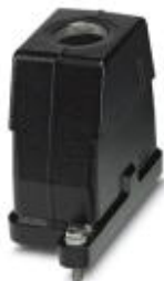
HEAVYCON B10 sleeve housing, HPR series, with screw locking, with M25 thread, straight outlet, for increased environmental and EMC requirements

Please be informed that the data shown in this PDF Document is generated from our Online Catalog. Please find the complete data in the user's documentation. Our General Terms of Use for Downloads are valid ( http://phoenixcontact.com/download )