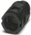
Cable gland, metric thread, IP68/69k protection, straight

Screw connection - WP-G HF IP69K M25 BK - 3240885