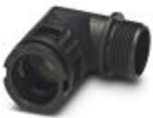
Cable gland, Pg thread, IP68/69k protection, angled

Screw connection - WP-GA HF IP69K PG21 BK - 3240906