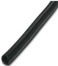
Polyamide protective hose, inflammability class HB, UV resistant

Please be informed that the data shown in this PDF Document is generated from our Online Catalog. Please find the complete data in the user's documentation. Our General Terms of Use for Downloads are valid ( http://phoenixcontact.com/download )