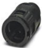
Cable gland, metric thread, IP66 protection, straight

Screw connection - WP-G HF IP66 M25 BK - 3240899