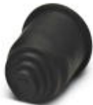
End sleeves, transition sleeves, from hose to cable

Transition sleeve from hose to cable - WP-EC TPE HF 28,5 BK - 3240978